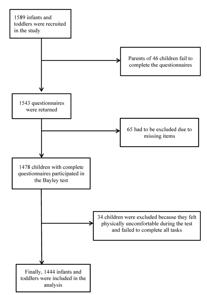
Figure 1 Number of infants and toddlers who completed the questionnaire and tests.

We conducted a cross-sectional study in mainland China from May to December of 2011. We used a stratified sampling technique, with area, gender and months of age as stratification variables. A total of 1589 children aged between 16 days and 42 months were selected from three children's healthcare institutions in medium-sized cities distributed across three geographic regions: North China, Middle China and East China. The selection of age bands was based on the categories proposed in the Bayley-III technical manual (totaling 48 age bands). The inclusion criteria for infants and toddlers included: singleton and born at term, born without significant medical complications, did not have a history of medical complications, and not currently diagnosed with or receiving treatment