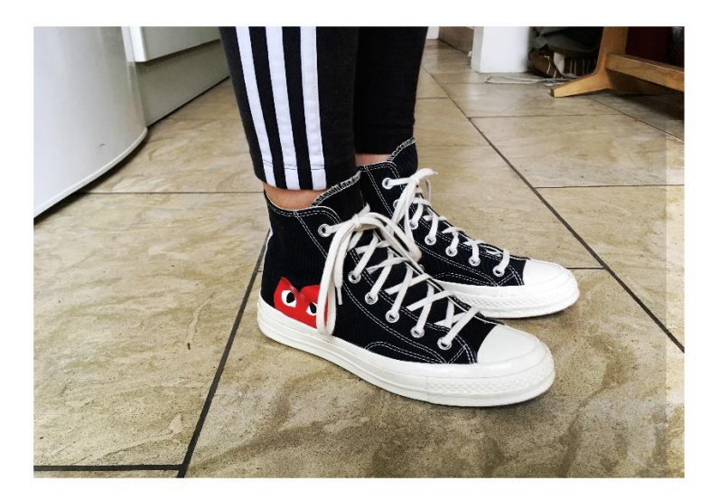
Figure 6: Matilda in her Converse

These shoes are practical, comfortable and make me feel different to others (Matilda interview 2018)