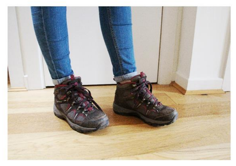
Figure 2: Marsh's Muddy Walking Boots

approach was that the teenagers most commonly chose a pair of shoes to discuss that had positive experiences and memories. On reflection this would not always allow an alternative perspective to their sense of self-identity. However, the interviews were instrumental in sensitively drawing out wider feelings about the self which sought to overcome this potential limitation. The interviews created discussion around the meaningfulness of the shoes, experiences of wear, how they came to own them and what they felt the shoes said about their identity. Recounting previous occasions when they had worn the shoes was a fascinating insight into the significance of memories and life experience in framing identity. Focusing on the materiality of the shoes, it was intriguing to watch the teenagers describe how the scuffs on the shoe's surface or the remnants of mud embedded on the soles were embodiments of meaningful moments in their lives. While the photographs represent the traces of wear, the supporting narratives reveal the meaningfulness of these traces as material representations of life experience and how that contributes to their biography and sense of self-identity. Marsh's image of her beloved walking boots in figure 2, and the direct quote evidence how meaning is embedded through wear and the patina of the object.