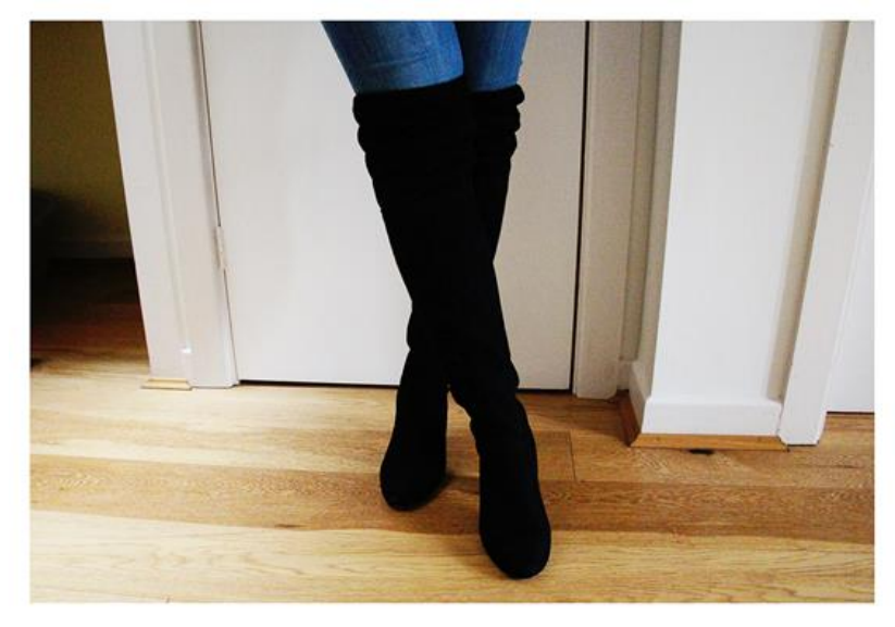
Figure 8: Marsh's Fancy Boots

These are definitely me because they are very fancy. When I put them on, they make me feel like a put together woman, confident, fancy and a lot taller, which is always helpful when you are 5ft 2. A put together woman means you walk around; you know what you are doing and your clothes and shoes reference that. You walk in a place you feel good in yourself, you feel confident, like your shoes can conquer the world. (Marsh interview 2017)