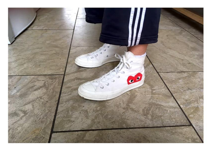
Figure 5: Ella in Converse

I feel individual, comfortable and confident. I prefer to be different and dislike being the same as others (Ella interview 2018)