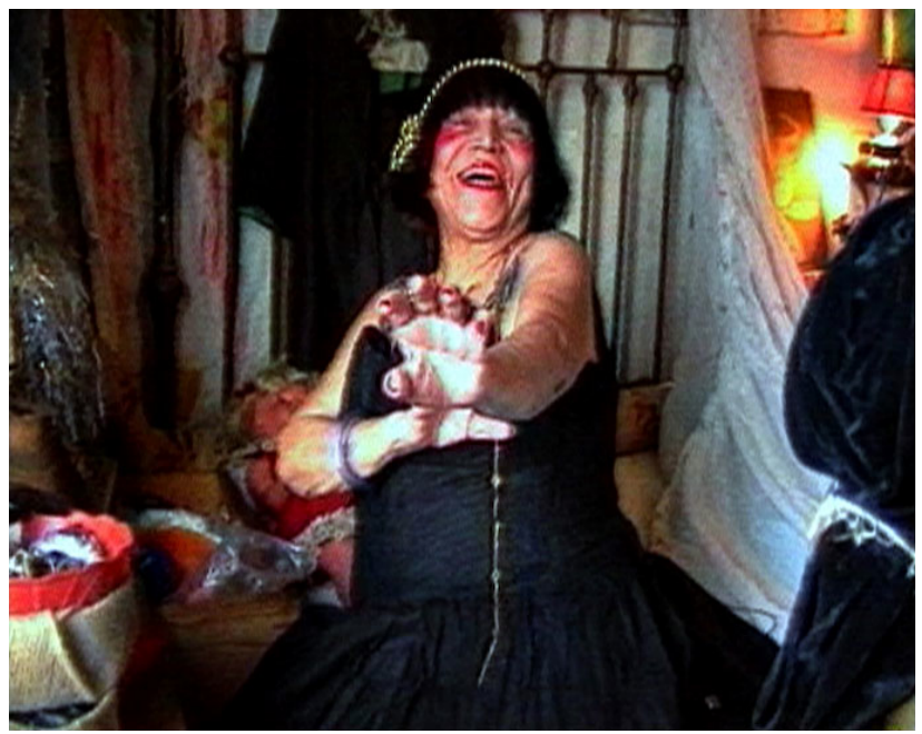
Fig. 1: Kutluğ Ataman, semiha b. unplugged , 1997. Single-screen video installation.