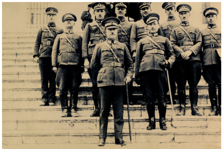
Fig. 5: Kutluğ Ataman, Frame from Mesopotomian Dramaturgies series, 2009.

false logic in Frame , according to Ataman, allegorises the 'lack of the experience of Renaissance' (Ataman in Çavuş's KA 2011): it is a photograph lacking the critical originary cultural point in photography's own history. What particularly interests the artist here is the creative tensions in these failed translations that 'create their own versions of modernity' (ibid.). Regionality confronts the global gaze in Ataman's self-regioning discourse.