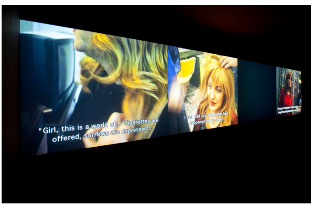
Fig. 2: Kutluğ Ataman, Women Who Wear Wigs , 1999. Multi-screen video installation.

Moreover, the four adjacent screens with simultaneously looping conversations in Women Who Wear Wigs (1999) (Fig. 2) do not only reveal the oral-visual cacophony of the four Turkish women (each with radically different reasons for wearing wigs: a balding transsexual, an ex-revolutionary, a Muslim student, and a cancer patient under treatment) but also offers indefinite possibilities for spectatorial experience. The lengths of the looping videos are different from each other, which produces different snapshots of the four-screen installation throughout the flow of videos: the women encounter each other anew and the viewer is constantly being addressed by this dynamic video-sculpture. This implies an intermedial experimentation with an 'oral