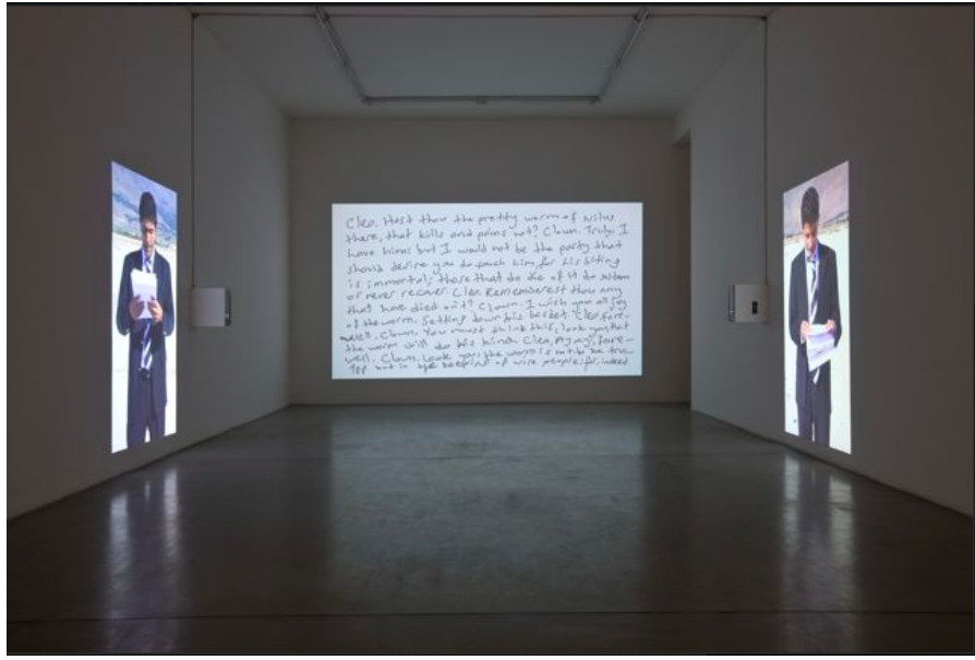
Fig. 8: Kutluğ Ataman, English as a Second Language and The Complete Works of William Shakespeare from Mesopotomian Dramaturgies series, 2009.

The two works of the series, English as a Second Language and The Complete Works of William Shakespeare (Fig. 8), further question modernity as a phenomenon of failed translation in making the failure a performative creative act. Whereas the former presents Turkish youth reading out aloud the rhymes of Edward Lear, the latter is a four-and-a-half minute projection of the handwritten transcription of all of Shakespeare's plays. While the former treats English as lingua franca of the modern and '[mocks] the illusory universality of globalization' (Perella 2010:24), the latter performs an extratextual translation, or perhaps a cross-cultural transfiguration, from text to calligraphic image. In other words, what Ataman already explored in Frame , Column and Dome by mediating cultural alterity via originally western art forms in order to demonstrate paradoxes of translation, is being literalised in English as a Second Language and The Complete Works . While these two works comment critically on the republican vision of modernity in Turkey as adaptation, or hegemonic translation from above, they also demonstrate the diverse transformative potentials in