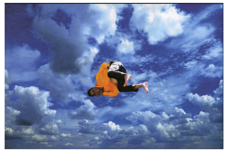
Fig. 7.1, 7.2 & 7.3: Kutluğ Ataman, Dome from Mesopotomian Dramaturgies series, 2009.