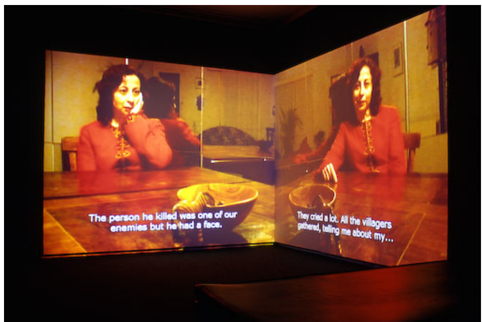
Fig. 3: Kutluğ Ataman, l+l=1, 2002. Two-screen video installation. Courtesy of the artist and Thomas Dane Gallery, London. Reproduced with permission.

Following Thierry de Duve's (2007) critical focus on glocalisation of contemporary arts and the corresponding predicaments of aesthetic judgement, Angela Dimitrakaki (2012: 317) suggests that the ethnographic turn in global arts risks 'the collapse of pedagogy into the consumption of [cultural, or indigenous] 'outputs', which is of course a ubiquitous feature of the post-Fordist knowledge economy.' In Dimitrakaki's discussion of the 'ethnographic turn,' the 'radical gesture' within the presupposition of art's potential as 'social document,' that is exemplified by 'participatory, post-documentary video essay, [is] undone by its exhibition form':