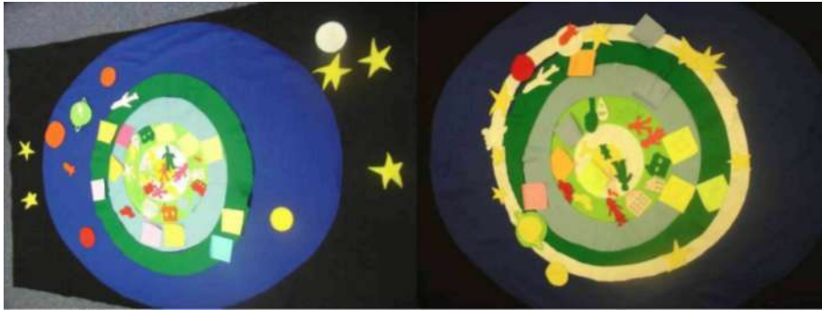
Figure 6: The Map of Universal Experience (Berridge School and Glenbrook School, Nottingham).