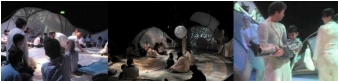
Figure 2: Young learners engaging with the performance of Cosmos.