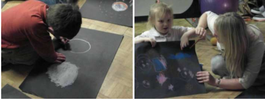
Figure 9: Children's drawings of their experience of 'floating in space'.