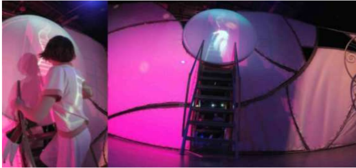
Figure 1: Little Girl climbing a ladder into space.