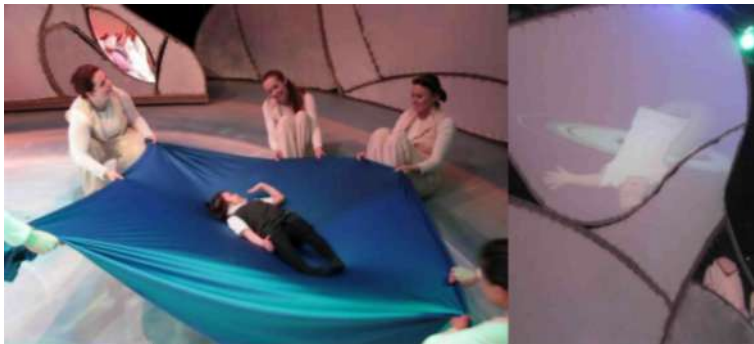
Figure 3: A young learner engaging with the blue screen technology.