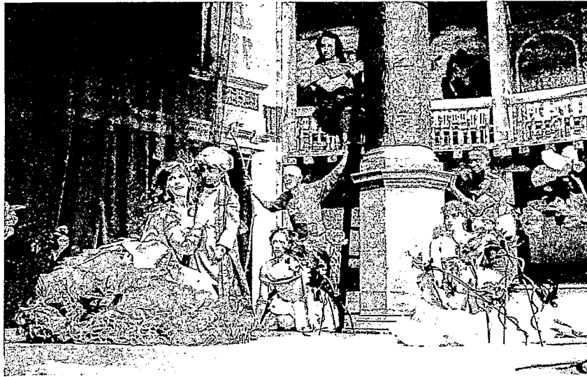
A Midsummer Night's Dream : Siobhan Redmond (left, Titania) and fairies.

floor which echoed the circularity of the moon hovering above. The black drape upstage fell to be replaced with one of diaphanous royal blue and the two arch-shaped walkways, like lunar crescents, which descended from either side of the stage down into the yard, were of the same color. The fairies were costumed in purple, green, blue or red tutus with torn and rebelliously unkempt lace and fishnets in a post-punk refutation of courtly authority. Puck's parodic tails were turquoise- and white-striped and his hair sported a wave of greenish-blue.