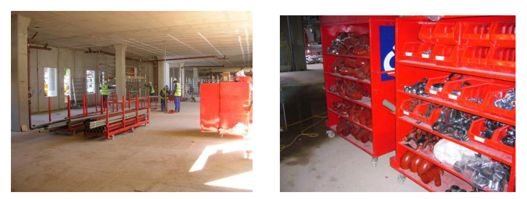
Figure 4. New thinking in operational design developed with the workforce

Planning workshops – these were continuing events throughout the project duration and took several forms: