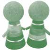
Frieda Vanderpump Chums