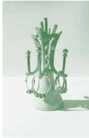
Harriet Shooter-Redfearn Salvage