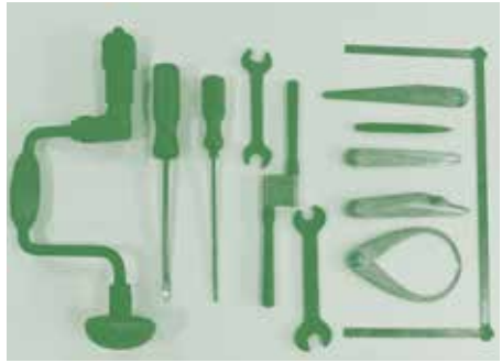
— Alan Crisp