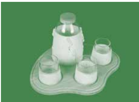
Tao Shen Airware