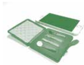
— Gordon Young Phone Care Set