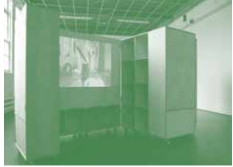
— Price & Gore Architects / Primary Paravent Crates