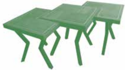
- Calum Gardner Fragment