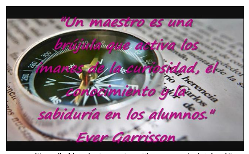
Figure 3: Metaphoric meaning with a compass in Artefact 10

With regard to the digital characteristics of the artefacts as OER, more than a half of the artefacts include one or more photographs taken by the students themselves. Most of these depict their own childhood and show moments of play, free time and happiness. Photographs with Creative Commons licenses also tend to depict images of children/childhood and in one case used to communicate metaphoric meaning: Artefact 10 represents the figure of the teacher using a compass (see Figure 3).