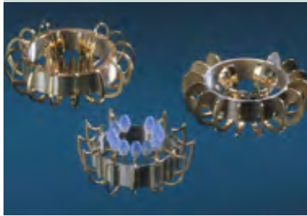
Figures 3(L) & 4(R): Showing Niedderer's original pieces that the prototypes were based on and the first CAD model

The crafting approaches discussed here demonstrate how creative innovation occurs when established practices of making are integrated with, or reinterpreted via advanced technologies. The case studies go some way to proving Adamson's assertion that craft should not be viewed as 'static ground', from which a superior form of digital production 'emerges'. (Adamson in Openshaw 2015: 287) The relationships between different (craft) disciplines, bodies of knowledge, and technologies are iterative, or as Adamson calls them, 'recursive' (Ibid.). The role of tacit or the 'tactile acquisition of knowledge' (Philpott 2012: 53) of materials and making are also highlighted as