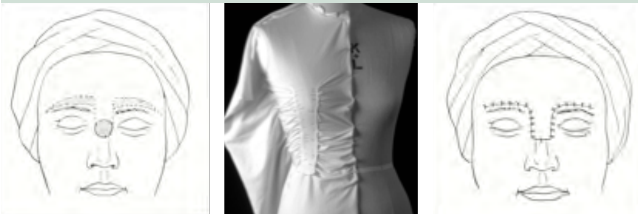
Figure 1a-c: Toile by Juliana Sissons based on plastic surgery reconstruction for Skinship (2015)

Findings from the SKINship initiative include considerations of grain direction, colour (skin tone), pattern, and thickness of 'cloth', as guiding factors to inform the 'cut and construction' processes of the body for each 'craftsman'. The fashion and surgical practitioners have also observed technical similarities in the use of geometry, the opening and closing of angles, to create or reduce fullness and form, in addition to the capabilities of each party to visualise the body in two and three dimensions when creating symmetry through shaping (Skinship 2015). By drawing on the similarities (and sometimes differences) of how practitioners in each discipline 'think and work' (Cross 2011), SKINship is currently developing innovative tools, such as a surgical teaching garment that communicates two types of breast reconstruction procedure to patients.