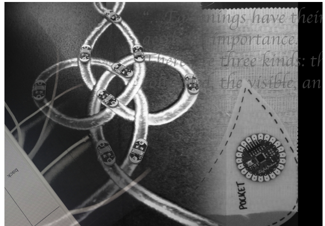
Figure 3. playful layering with components, materials, and pattern pieces

Following the Newstead Abbey visit, a workshop was devised to allow experiment and exploration with the research materials, including photographic material from the archives and of the garments, personal hoards of fabrics, favourite books, old sketchbooks and design drawings, and e-textile components. During this first session, we unearthed themes in our own practices, asked about each other’s inspirational material, and faced up to a wealth of starting points and wishful thinking [15].