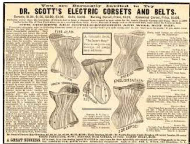
Figure 1. Corsetry adverts inspired this project, with their technological promises and relationship with the human body.

Galleries. We selected, over a number of visits to the archive, three broad categories of garment to exhibit, initially at the Crafting Anatomies exhibition at Bonington Gallery, Nottingham, UK [3]. These were corsets, collars and a footman's livery.