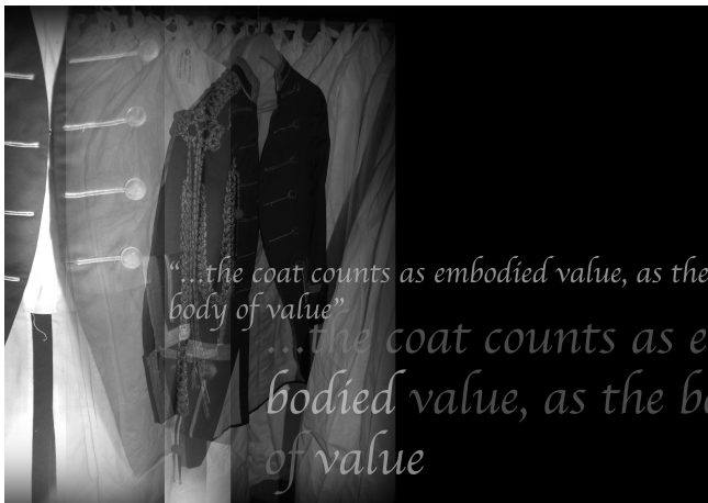
Figure 2. Footman’s livery, circa 1890

see the Utility Clothing mark (a double ‘C’ form, looking like two coffee beans) – this was a mark given to pieces that had been made in accordance with the austerity measures during the Second World War – this collar had been made within restrictions on the amount of material used. Collars may be an obvious example of items that are detachable and cared for separately, but we found that sleeves could also be a separate part of the garment, like an “extended glove” [4:60]; systems of remaking and fitting and ownership are another important area for further exploration.