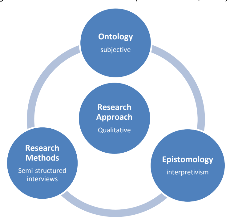
Figure 3.1 Research Framework (after Creswell, 2003)