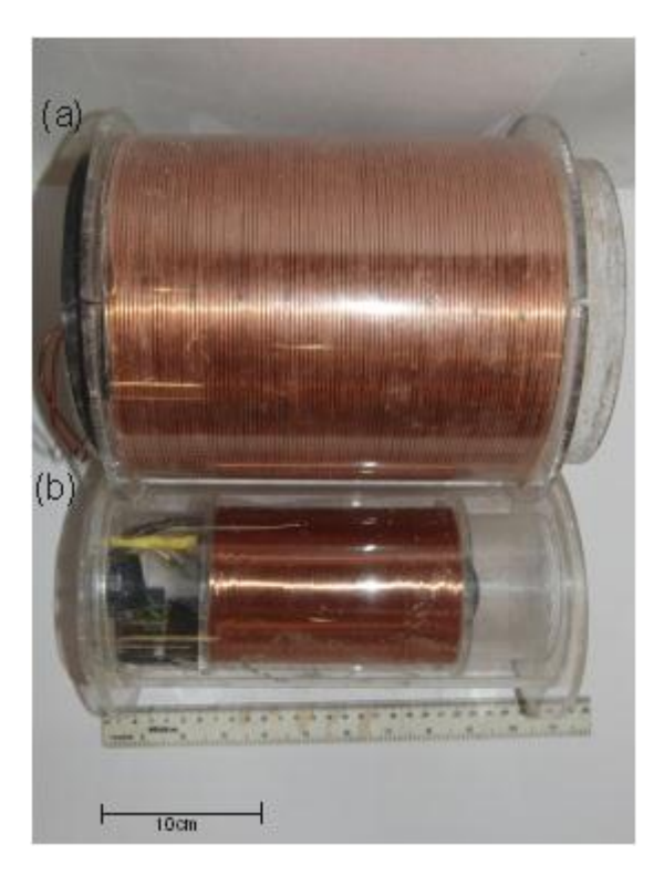
Fig. 1: The Earth's field nuclear magnetic resonance probe.(a) Polarising coil.(b) Transmit-receive coil.