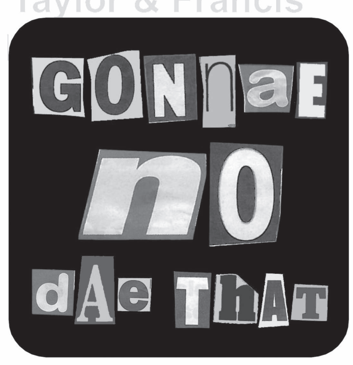
FIGURE 15.1 Glasgow mug design, used with permission, Sprint Design, Glasgow.