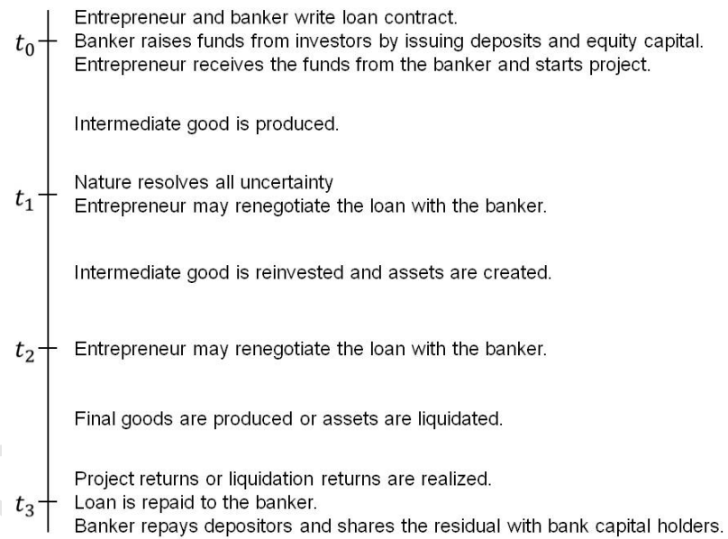
Figure 1: Sequence of events