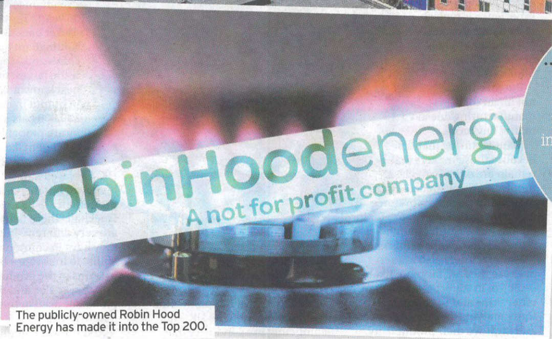
The publicly-owned Robin Hood Energy has made it into the Top 200.

P UBLISHING the Top 200 list of companies in Nottinghamshire once again provides an opportunity to reflect on what the list tells us about our local economy.