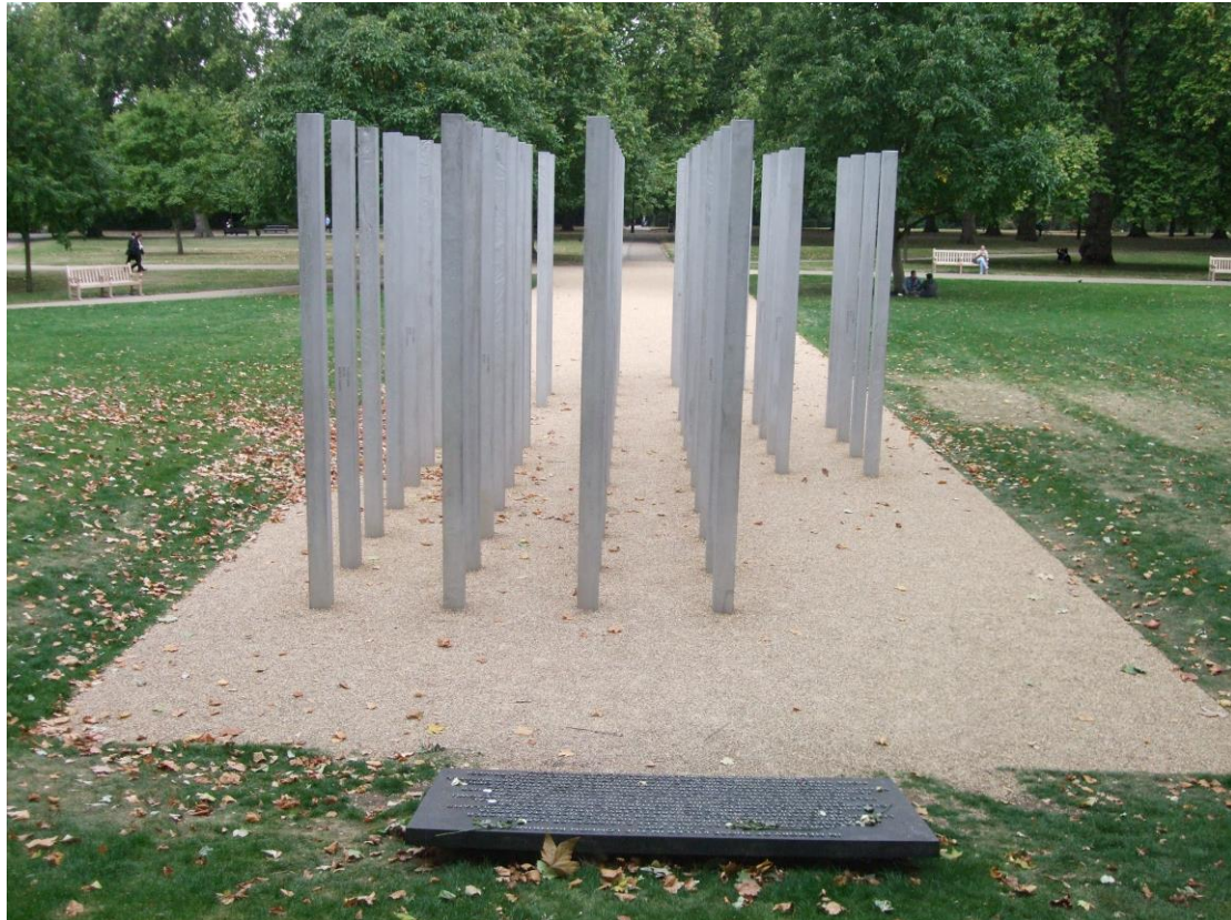
Fig 1. 7 July Memorial in Hyde Park

opened in Hyde Park. The installation comprises 52 separate steel pillars ('stelae') clustered into four groups that give an impression of the geographic distribution of the four bombings (see fig. 1). Each stele – one for every victim – is inscribed with the date and respective time of the explosion as well as the location of the attack. Adjacent to the memorial there is a plaque that bears the names of those who died.