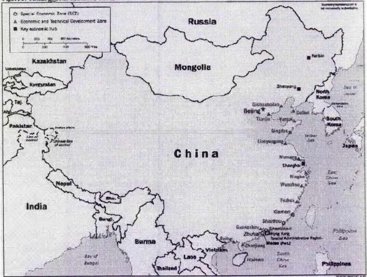
Figure 3. China: Special Economic Zones

(Internet source: http://www.odci.gov/cia/publications/hies97/b/fig3.jpg )