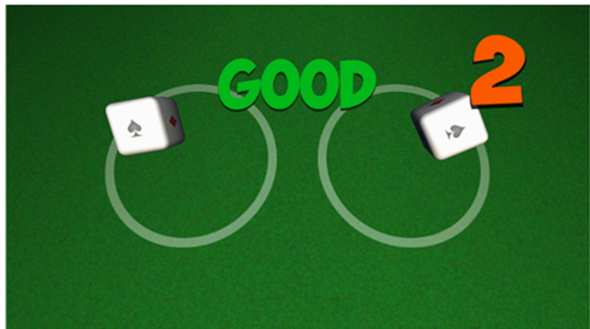
Fig. 2 Screenshot of stop-signal game intervention (duration: 3 minutes)

emotionally to negative and positive stimuli respectively, and lack of premeditation refers to acting without thinking (Whiteside and Lynam 2001). Additionally, Whiteside and Lynam (2001) defined lack of perseverance as an inability to remain focussed on a task, and finally, sensation seeking as seeking out novelty (Whiteside and Lynam 2001). A valid and reliable 59-item scale to measure the five domains of trait impulsivity (UPPS-P; Lynam et al. 2007) was employed to measure the multiple dimensions of the participants' impulsivity. The UPPS-P has been previously used to successfully identify the specific prediction value of various impulsivity domains on appetitive behaviour (e.g. nicotine use behaviour, see Flory and Manuck 2009; Spillane et al. 2010). Estimates of internal reliability of the UPPS-P Scale for this sample included: Negative Urgency ( \alpha = 0.88 ), Lack of Premeditation ( \alpha = 0.85 ), Lack of Perseveration ( \alpha = 0.86 ), Sensation Seeking ( \alpha = 0.85 ) and Positive Urgency ( \alpha = 0.93 ).