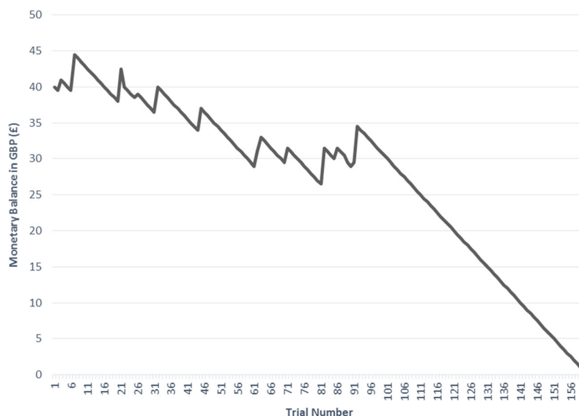
Fig. 3 Standardised sequence of gambling outcomes of diamond pairs gambling task (160 trial maximum)

experiment were determined at random. As demonstrated in Fig. 3, the gambling task provided a series of wins (between £0.50 and £5.50) dispersed between Trials 1 and 91, after which no further wins were provided until Trial 160 where the participant's funds would be depleted and the game would cease. After Trial 100 had elapsed participants could choose to stop gambling and collect the remaining money; at this point the monetary total was £30, representing a 25% monetary loss from the original sum provided. In the experimental conditions that contained interventions, they were presented immediately after the completion of Trial 100 to standardise the sequence, even though participants were informed that the intervention would emerge at a random point during the game. Before the experiment commenced participants were provided with the following information 'Please note that Diamond Pairs operates on a payback percentage similar to other forms of commercial gambling, and therefore in the long-term the probability of winning is not in your favour'.