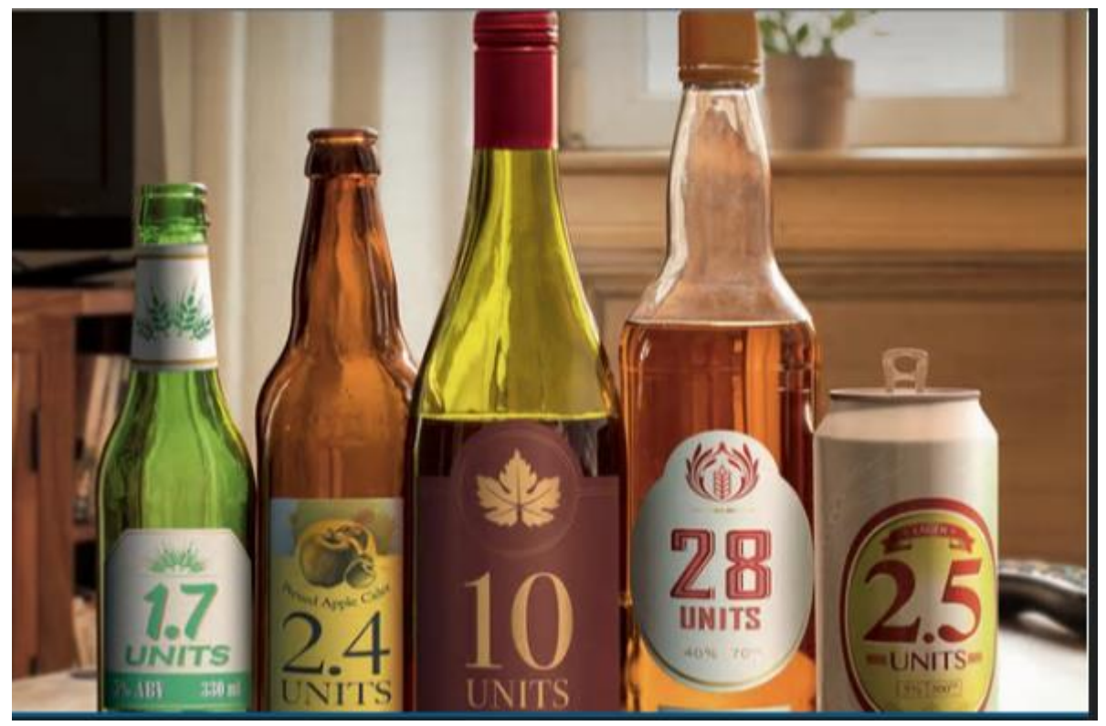
Figure 6. Alcohol content (units) information on alcohol bottles and cans

Different types of alcohol showing different alcohol unit content in each bottle