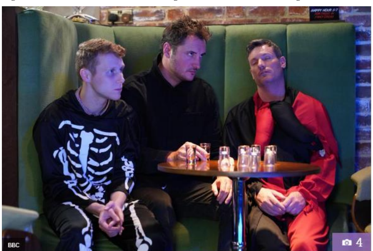
Figure 9. EastEnders characters drinking alcohol shots in the local night club

What is particularly significant is that the UKCTAS report used the screen grab (figure 9) from EastEnders , showing some of the EastEnders characters drinking excessively in the local night club. This imagery echoes concerns discussed earlier.