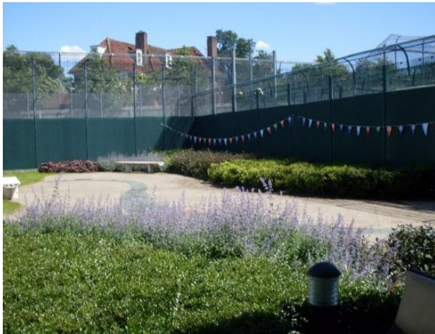
Figure 1: Forensic unit garden

The space in this photograph is a complex and contradictory one. In the foreground, there is a well cultivated garden featuring a bench, seemingly positioned for quiet reflection. Beds of lavender evoke repose and restoration. Flags indicate a sense of community and celebration. As the eye travels up the image, however, the height of the surrounding fences troubles this peaceful picture. Upon closer inspection these fences are not only high, but hostile and laced with barbed wire. Whether designed to keep the world out, or the users of the garden in, these fences stand in stark contrast to the restorative garden below. Threat of harm, whether past or potential, permeates the space; what else could have necessitated such intimidating structures.