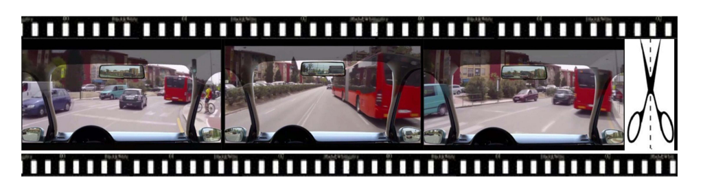
Figure I The 3 images represent the end of a video-clip (for example, this clip where the hazard is a bus that enters our lane) followed by an occlusion panel (cut-to-black) and finally the 4 multiple choice options are shown on screen.

The interaction between these factors approached significance [F(2166)=10.26, p<0.08, \eta^2 p=0.057 ] but only marginally. The main effect of locality was significant [F(1166)=8.27, p<0.005, \eta^2 p=0.047 ], with higher scores for the same country clips from Spain ( Mean = 71.66, Standard Deviation = 12.54) than for the different country clips from the UK (M=68.84, SD=15.77). A significant main effect of driving experience was also found [F(2166)=10.26, p<0.005, \eta^2 p=0.1 ]. Non-drivers (M=65.83, SD =13.02) performed worse than novice drivers (M=70.92, SD=14.25), with the experienced drivers producing the highest scores (M=7400