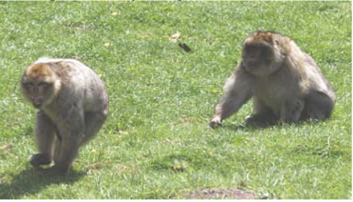
Figure 1. Example of Barbary macaque social interaction scenes. doi:10.1371/journal.pone.0056437.g001

The number of fixations and viewing time directed at each local region were normalized as a proportion of the total number of fixations and viewing time sampled in that trial. As the same type of local region varied in size across intra- and inter-species images (e.g. two individuals in the same image could vary in body size), the proportion of the image area constituting each local region was subtracted from the proportion of viewing time directed at that region in a given trial. This measure gave us 'normalized' viewing time as a percentage for each image region, with positive or negative values indicating more or less viewing time than predicted by a uniform looking strategy [13,14].