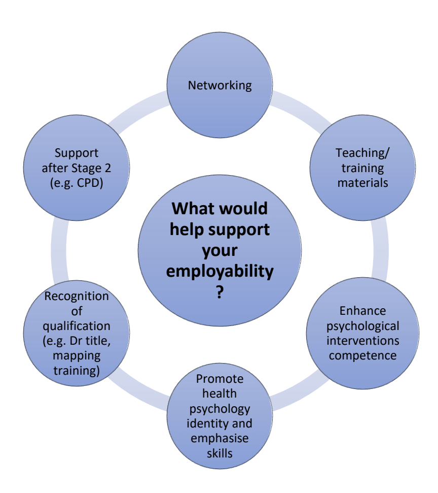
Figure 3: Visual representation of health psychology Stage 2 trainee and graduate's key messages for enhanced support