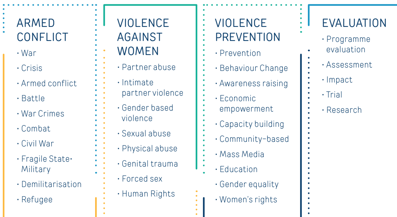
FIGURE A.1. SEARCH TERMS

A combination of terms was used relating to armed conflict, violence against women, prevention and evaluation. Boolean statements were used in each sub-category.