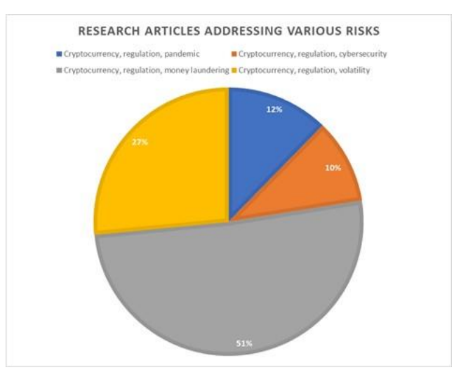
Fig.2: Research articles addressing various risks

The data extraction was undertaken through the Scopus database which included the research articles relevant to this research. The output from the database was generated in a comma-separated values (CSV) file in MS Excel format. The MS Excel CSV file included the information presented in Table 2.