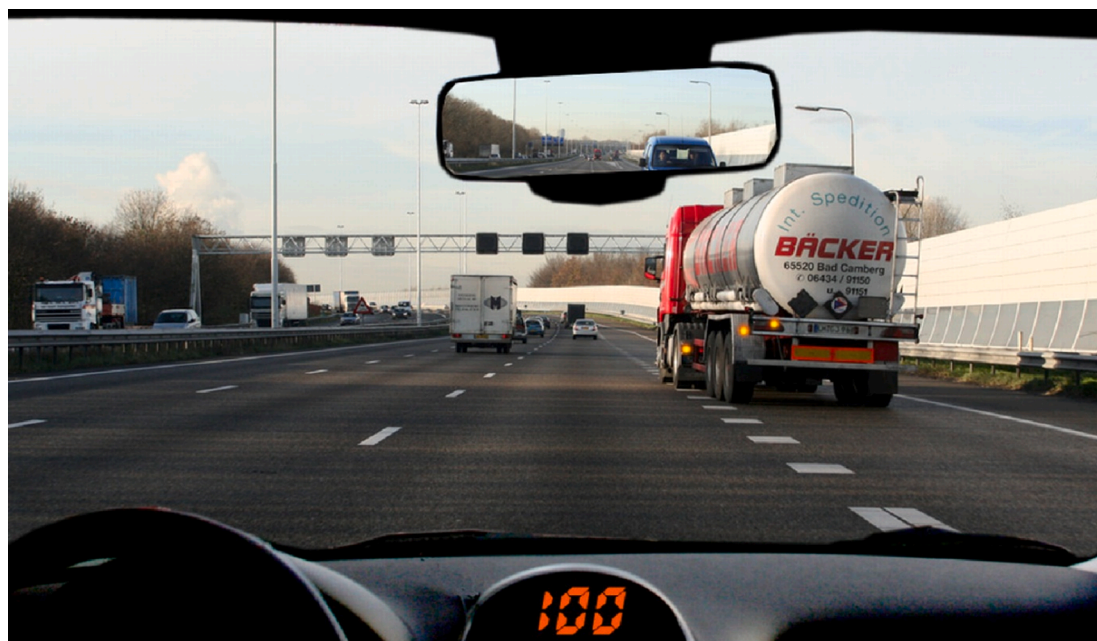
Fig. A2. Second scenario for preparatory survey version A. Caption shown to participants: “Driving on the highway at 100 km/h”. The hazard in this scenario concerns a speed differential with a truck intending to merge. In the Netherlands the maximum allowed speed for trucks is 80 km/h. .

One method of ranking SA requirements suggested during the interviews is the use of expert drivers. Asking expert drivers to rank the selected requirements based on importance to safety would result in the relative importance of requirements. However, experienced drivers are not always capable of explaining why certain elements should be considered more important than others and show