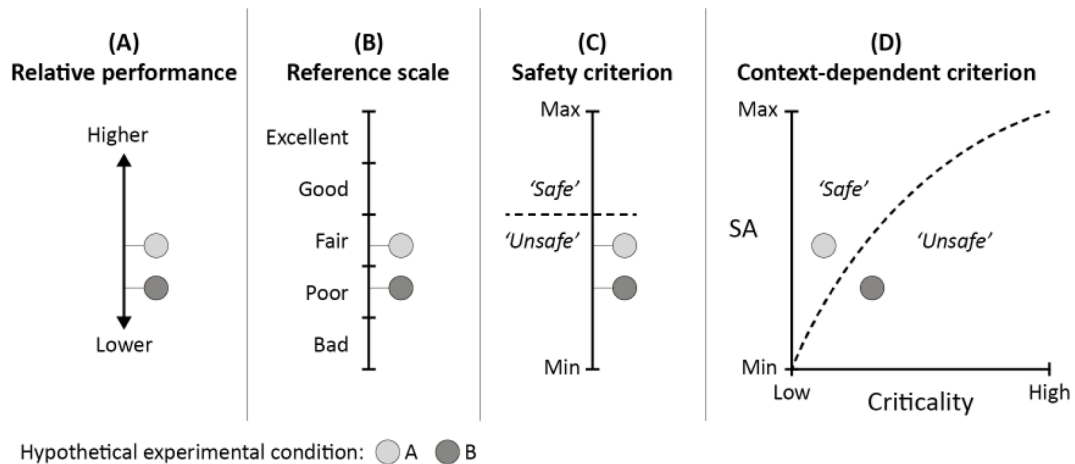
Fig. 1. Comparison of situation awareness (SA) performance between two hypothetical experimental conditions, based on relative performance (panel A), a reference scale (panel B), a safety criterion (panel C), and a context-dependent criterion (panel D).

However, no conclusions can be drawn on whether to interpret any given level of SA exhibited as ‘excellent’ versus ‘good’, or ‘fair’ versus ‘poor’, as such interpretation requires a reference scale (panel B). Moreover, a criterion is required if one additionally wishes to interpret SA performance in terms of safety (panel C). Such a criterion could potentially be established as the level of SA relevant to some safety performance indicator (e.g., crash involvement, minimal time-to-collision). Further, such a criterion could be dependent on context (panel D), such that the level of SA needed for any piece of information at any given time is related to the criticality of that information within the current context.