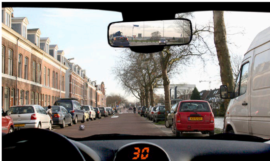
Fig. A1. First scenario for preparatory survey version A. Caption shown to participants: “Driving in the inner city at 30 km/h”. The hazard in this scenario concerns a child located between two parked cars, who may attempt to retrieve a football on the street. . Reprinted with permission. Source: Vlakveld (2011)