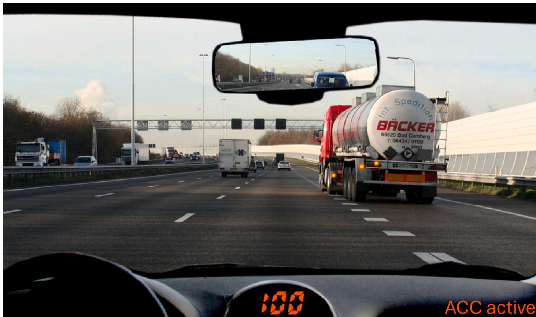
Fig. A4. Second scenario for preparatory survey version B. Caption shown to participants: “Driving with adaptive cruise control active on the highway at 100 km/h”. The hazard in this scenario concerns a speed differential with a truck intending to merge, combined with the notion that adaptive cruise control is active. In the Netherlands the maximum allowed speed for trucks is 80 km/h. . Reprinted with permission.