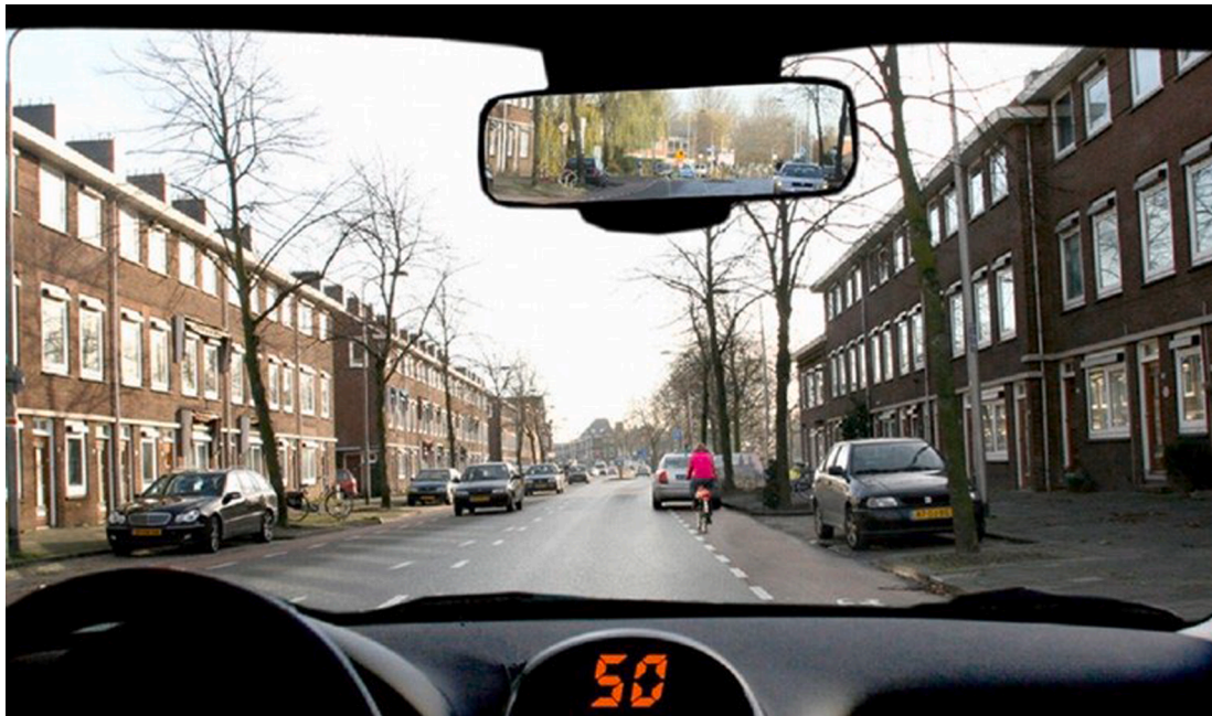
Fig. A3. First scenario for preparatory survey version B. Caption shown to participants: “Driving in the inner city at 50 km/h”. The hazard in this scenario concerns a bicyclist about to overtake a parked car. There is no room for the subject vehicle to overtake the bicyclist, due to oncoming traffic in the opposite direction. . Reprinted with permission.