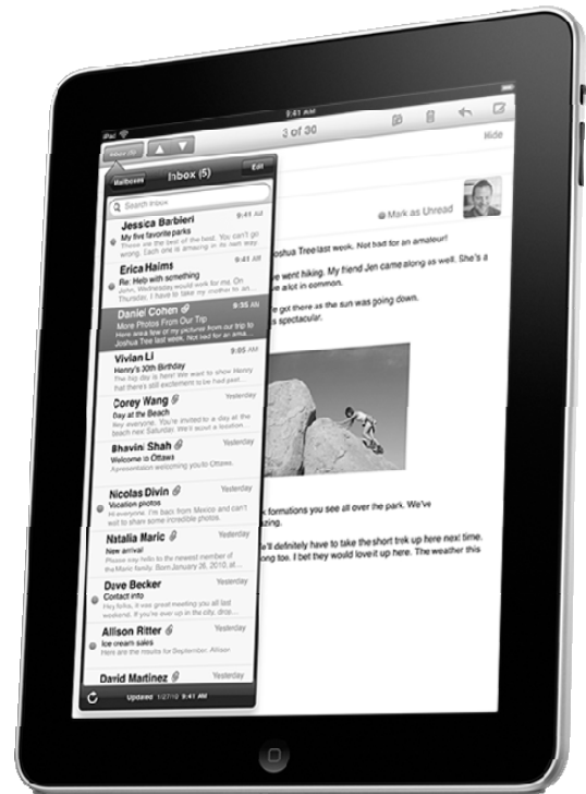
Figure 4: The Apple iPad (Apple, 2010)

Mobile devices offer a great opportunity for learning with respect to ICTs by older adults. Such devices also incorporate social networking facilitates. Social networking is a platform utilized by older adults (as well as other groups) who want to learn and use ICTs and their applications (Bogatti et al, 2003). The older adults can learn virtually, with their friends, family or colleagues. A mobile device that may be of significance to older adults is the Apple iPad. Its vertical and horizontal dimension is generally a lot larger than mobile phones, although its depth is considerably smaller in comparison. It can easily fit into a bag and so has good portability. It also has "Universal access" integrated into the phone to enhance its accessibility, particularly for those with usability and accessibility issues (Apple, 2010). See figure 4 Apple iPad is shown in Figure 4: